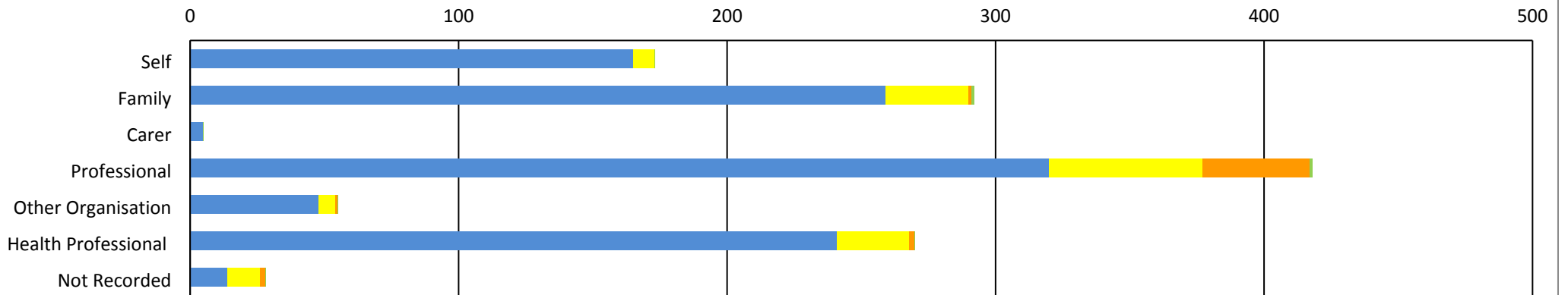
Number of WB Referrals Q1 2016-17